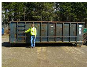
30 Yard 6' H x 7' 6" W x 20' L