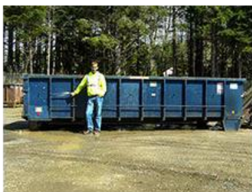
20 Yard (2 sizes available) 3' 6" H x 7' 6" W x 20' L or 4' 6" H x 7' 6" W x 16' L