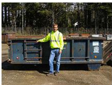
10 Yard 3' 8" H x 7' 6" W x 12' L

Drop boxes are available for scrap metal. Please call 541-994-5555 for rates and availability.