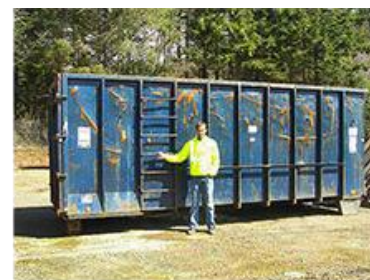
40 Yard 7' H x 7' 6" W x 20' L