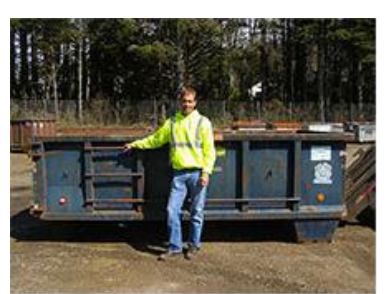
10 Yard 3′ 8″ H x 7′ 6″ W x 12′ L

Drop boxes are available for scrap metal. Please call 541-994-5555 for rates and availability.