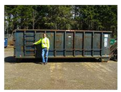
30 Yard 6' H x 7' 6" W x 20' L